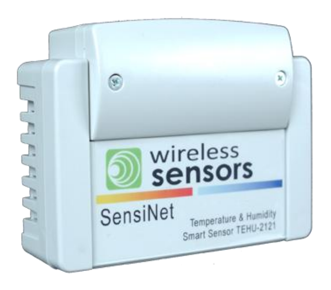
Model TEHU 2121

Flexible - Move, add or eliminate sensors and the network reconfigures itself automatically. Universal - Multiple protocols including Modbus, OPC, SNMP, ODBC, and Web Services ensure system compatibility or operate the system as a stand alone data logging system with local or web based logging. Scalable - The same network can start with a single point and grow to thousands without replacing any components or performance degradation.